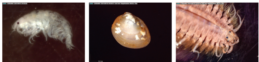
Figure 2: Macroinvertebrates collected from soft sediment habitats in Wellington Harbour during state of environment monitoring for Greater Wellington Regional Council (Photos: NIWA).

The C-SIG Species key tool was developed by NIWA in collaboration with Atlas Meanwhile Ltd. The population of the tool with taxonomic and ecological data, images, and maps, and building of the keys was funded from an MBIE funded Envirolink Tool