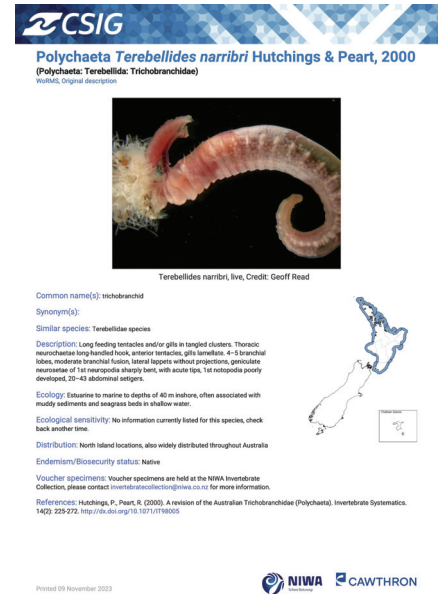
Figure 4: A species information page available through the tool for polychaete species Terebellides narribri.

Please direct any enquiries you might have about the tool to specieskey@niwa.co.nz or check out the tool for yourself at https://specieskey.atlasmd.com