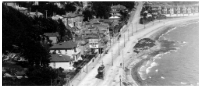
Oriental Bay, 1910.

Plans by the Wellington City Council to develop additional beach areas at Oriental Bay could provide the Capital with a major new recreational asset by the year 2000. Opus International Consultants (Opus) is working closely with the Council to develop this asset within an overall strategy for the greater Oriental Bay area over the next 10-30 years.